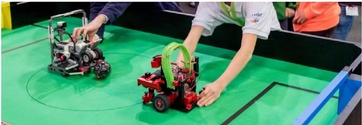
Figure 1 Two teams with one standard kit robot each will compete using an IR ball on RCJ Soccer fields without the out-area. There is no need for using camera vision or line detection.

The aim of this document is to provide an entry-level rule set for RCJ Soccer that is harmonized across countries in Europe and that may be referenced at European local and super-regional tournaments, as well as beyond Europe if needed. However, some sub-regions may have their own version of Soccer Entry rules. Teams are advised to check with their Local Organizing Committee and Regional Representative regarding updates and changes to this rule set specific to their location. Each team is responsible for verifying the correct and latest version of the rules prior to competition.